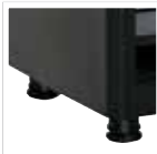
Heavy Duty adjustable legs