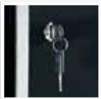
Fully lockable for secure storage