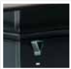
Easy adjustable shelves