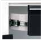
Full extension ball-bearing drawer slides